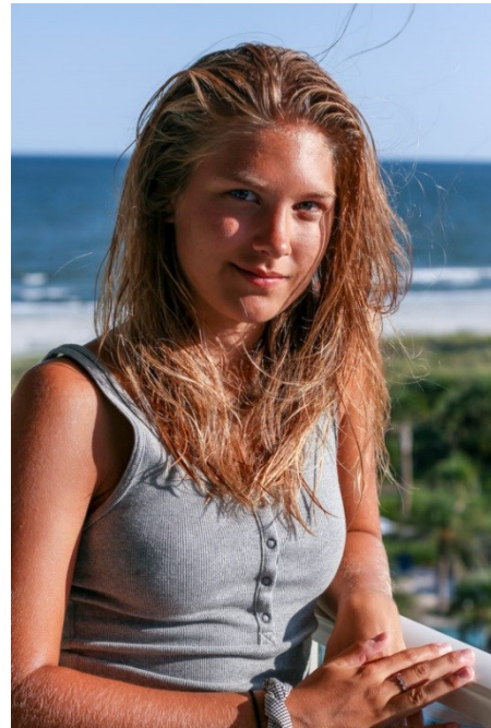
Elle est belle!

The French, like English speakers, often shorten things up. So instead of saying, comment ça va? they may just say, ça va? Similarly, when replying, they may just answer bien rather than je vais bien . And when meeting someone, you will often hear people just say enchantée rather than je suis enchantée .