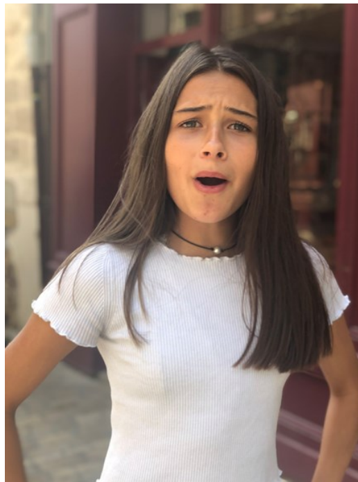
Elle n'est pas très agréable!

So there you go. You just expanded your French vocabulary by 22 words in about a minute!